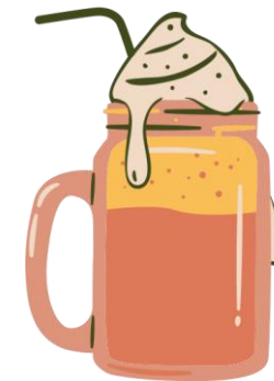
Meeting my friends